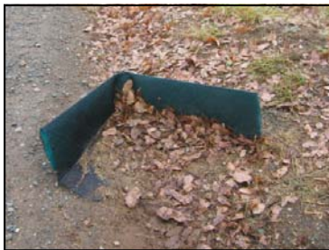
Velocity check for ditch or channel