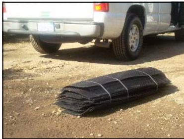
Packaged 30 feet per bundle