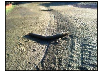
Fiber Rolls were installed first on the site and failed in the first storm