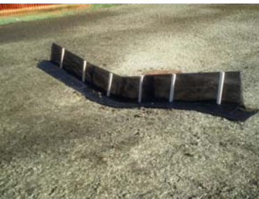
Two Stakes (1x1x18") per Segment

The Challenge: On this project, fiber rolls (wattles) were initially installed in the main off-site water conveyance channel and failed in the season's first storm. The fiber rolls (wattles) were undermined which caused concentrated high velocity flow which in turn led to scour and sediment movement. This is a common failure for fiber rolls which are not a good choice for slowing and spreading concentrated flow in channels. Additionally, construction projects often last 12 months or more and it is typical for a large percentage of the fiber rolls to require maintenance or replacement.