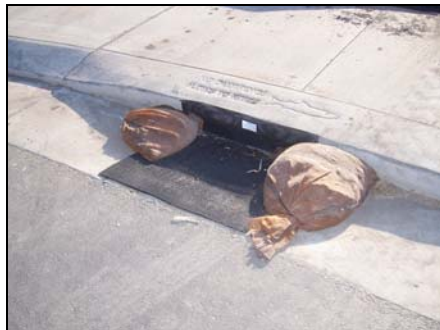
Anchored with Gravel Bags