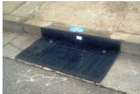
Anchored with ERTEC GR-8 Hooks™