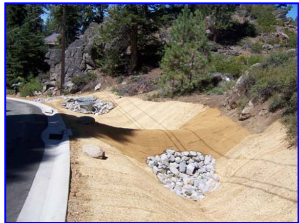
Figure 6: 2 months after installation