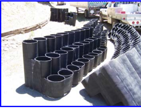
Figure 3: Section assembly