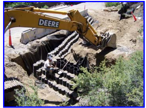
Figure 4: Filling of inter-basin berm trenching