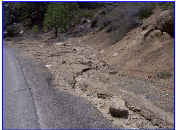
Fig 2: Pre-conditions. Location of proposed basins