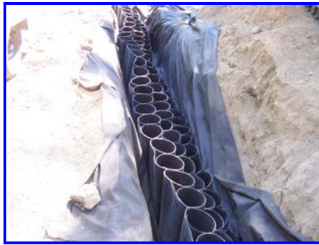
Figure 4: Section placement—post trenching—bank protection