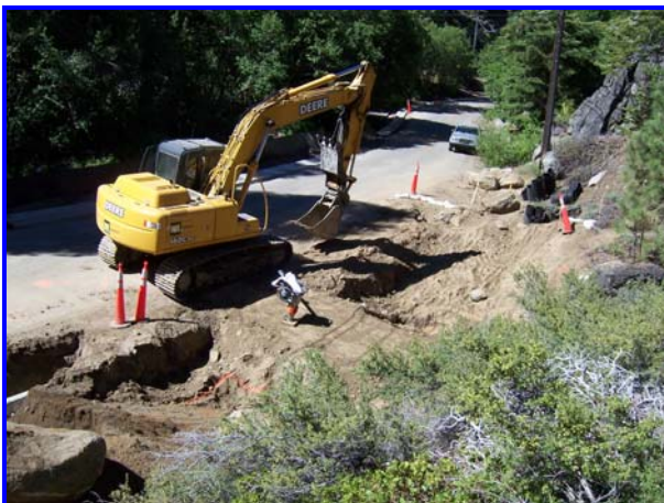
Figure 5: During backfill and basin forming

This was a successful program for the following reasons: low cost, simple, and robust with Immediate protection of existing resources.