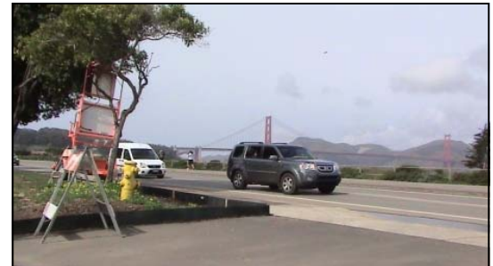
The project is located alongside San Francisco Bay

The Challenge: The current best practice is to use traditional silt fence to keep sediment from moving off-site. Unfortunately, it is common to see silt fence topple in the wind, break down in UV light or allow ponding and undercutting during storms. Road Construction projects often last 18 months or more and it is typical for a large percentage of the silt fence installation to require maintenance or even complete replacement. Estimators often overlook the cost of silt fence maintenance, removal and waste handling. Proper installation, removal and disposal is costly. On multi-phase projects, it is also desirable to relocate and reuse the BMP as construction progresses, rather than dispose and start a new phase with new materials.