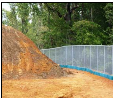
Perimeter & stockpile protection

Application: Commercial Construction, Perimeter Sediment Control Product: ERTEC S-Fence™ Customer: WRL General Contractors — Flint, Texas Projects: Three New Public Elementary Schools Longview, Texas Project Date: Spring 2009