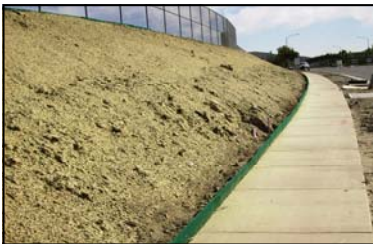
Protection at top and base of slope

The Challenge: The current best practice is to use silt fence to keep sediment from moving off-site. Unfortunately, it is not uncommon to see silt fence become ineffective by toppling in the wind, breaking down in UV light or allowing undercutting in areas where it is not trenched properly. Storm water underflow, end-arounds and overtopping is common. Commercial Construction projects often last 18 months or more and it is typical for a large percentage of the silt fence installation to require maintenance or replacement. Additionally, estimators often overlook the cost of silt fence removal and waste handling. Proper installation, removal and disposal is costly. On multi-phase projects, it is also desirable to relocate and reuse the BMP as construction progresses.