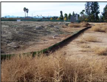
Perimeter & stockpile protection

The Challenge: The current best practice is to use silt fence to keep sediment from moving off-site. Unfortunately, it is not uncommon to see silt fence become ineffective by toppling in the wind, breaking down in UV light or allowing undercutting in areas where it is not trenched properly. Storm water underflow, end-arounds and overtopping is common. Commercial Construction projects often last 18 months or more and it is typical for a large percentage of the silt fence installation to require maintenance or replacement. Additionally, estimators often overlook the cost of silt fence removal and waste handling. Proper installation, removal and disposal is costly. On multi-phase projects, it is also desirable to relocate and reuse the BMP as construction progresses.