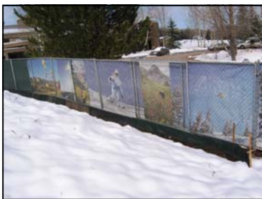
Stands up to winter conditions

The Challenge: The current best practice is to use silt fence to keep sediment from moving off-site. Unfortunately, it is common to see silt fence toppling in the wind, breaking down in UV light or allowing undercutting in areas where it is not trenched properly. Storm water underflow, end-arounds and overtopping is common. Commercial Construction projects often last 18 months or more and it is typical for a large percentage of the silt fence installation to require maintenance or replacement. Estimators often overlook the cost of silt fence maintenance, removal and waste handling. Proper installation, removal and disposal is costly. On multi-phase projects, it is also desirable to relocate and reuse BMPs as construction progresses. This is not possible with silt fence or wattles.